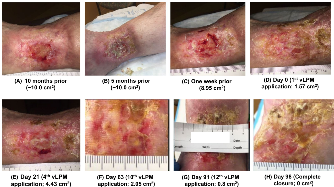
FIGURE 1 (A-H) Progression of the wound 10 mo prior to vLPM treatment until complete closure at day 98

In the current study, we evaluated vLPM in the treatment of a chronic radiation necrosis wound that resulted from squamous cell carcinoma radiation therapy, post-surgical tumor excision in a patient with multiple comorbidities. Radiation triggers cell death and impairs cell functionality including migration, proliferation, differentiation, and secretion of extracellular matrix proteins and growth factors. Radiation directly damages fibroblasts causing a decrease in collagen production and loss of collagen function. 1 Further, the presence of reactive oxygen species can lead to the dysregulated production of myofibroblasts, causing an abnormal production of collagen. This is referred to as radiation-induced fibrosis, which prevents wound healing as it inhibits inflammatory cells and impairs angiogenesis, both of which are required to remove bacteria and dead cells, and re-establish microvasculature at the injury site. 1 As all cellular activities key to the wound healing process are heavily compromised after